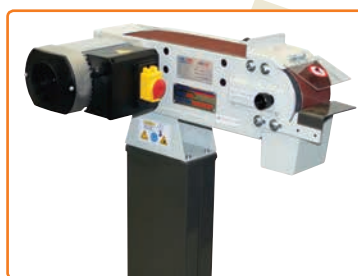
Shown With Top Lid Open